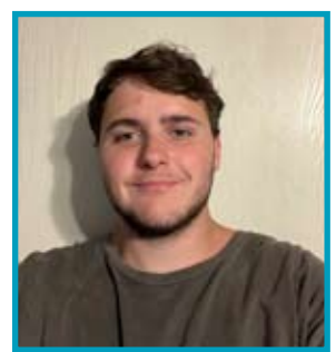
ZACHARY BOSTON COMMUNITY