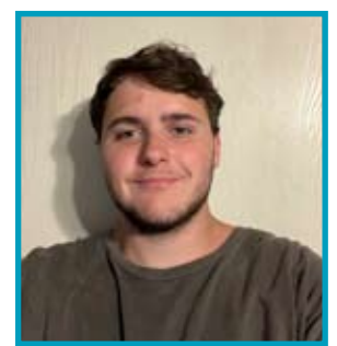
ZACHARY BOSTON COMMUNITY